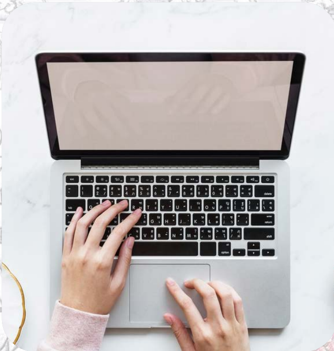
Listening and dialogue

We develop themes and concepts with the support of our designers and we create moodboards and maps. We discuss the project with our clients and proceed with drawings to let them understand what the final design will look like. The secret is listening to our couple's needs and offering innovative and creative solutions.