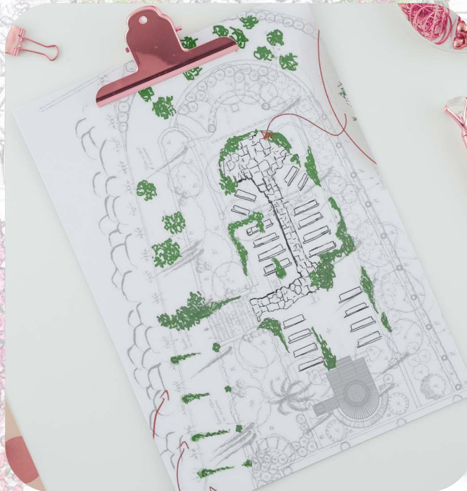
Idea and concept